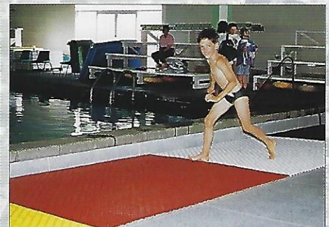
Protection when you need it most!

Due to the use of recycled materials some colour variations may occur.