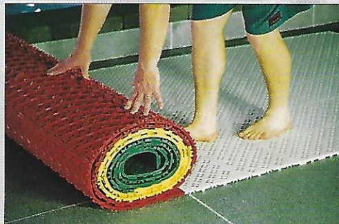
Easy to roll

Length of mitred ramp 560mm (22") x 60mm (2") Length of straight ramp 500mm (20") x 60mm (2") Tapered from 2mm (1/16") - 15mm (9/16") over the width Weight 225 grams (8 oz.)